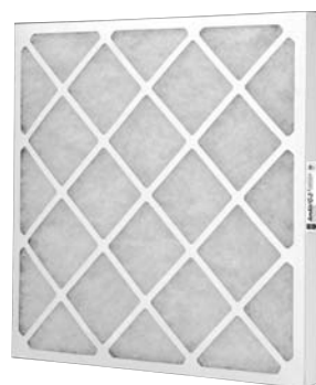
AmAir®/C-3 carbon panel filter

AmAir/C-3 2" panel filters are directly interchangeable with standard 2" air filters. The AmAir/C-3 panel offers more carbon density per square foot than the 2" pleated model.