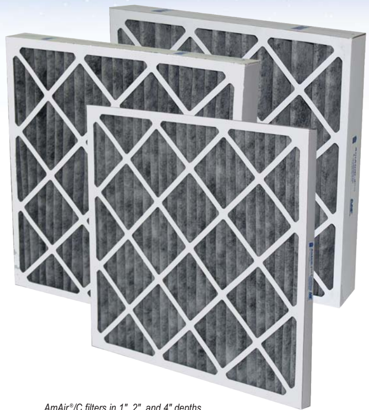
AmAir®/C filters in 1", 2", and 4" depths

The effectiveness of any gas-phase filter corresponds to the density (weight per square foot) of activated carbon contained in the product. AmAir/C, AmAir/C+SAAFoxi, and AmAir/SAAFoxi filters are more effective than other odor control filters, because they contain more chemical media, using AAF's SAAFWeb™ technology.